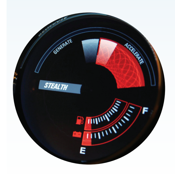
Fisker-Karma Instrument Cluster