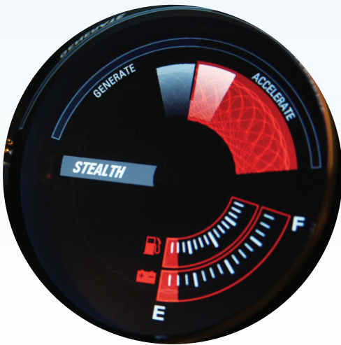
Fisker-Karma Instrument Cluster

Inverom Li-ion BMS solutions deliver a wide variety of stored energy applications.